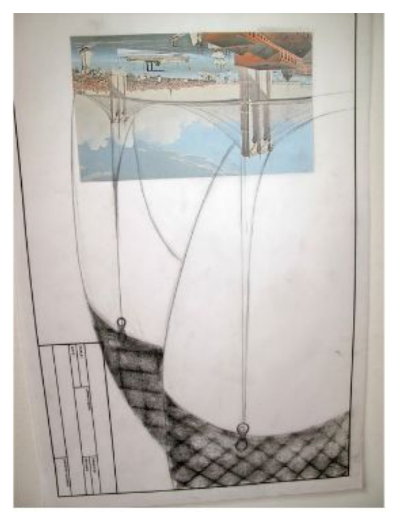
"Brooklyn Bridge suspension system prepares to meet the Pont Neuf."