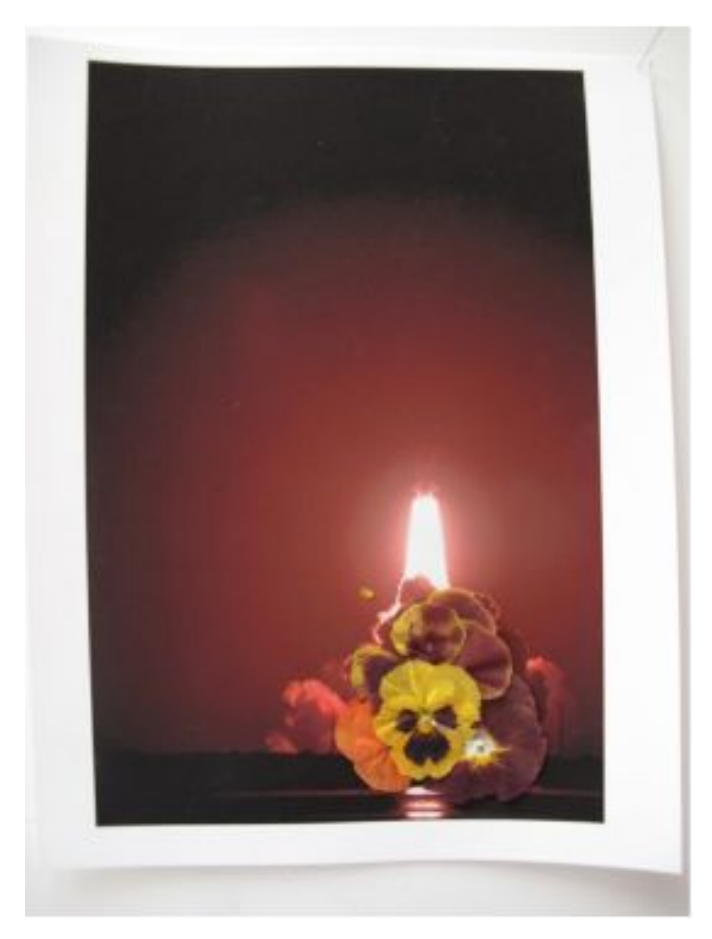
So many pansies could fuel a rocket launch.