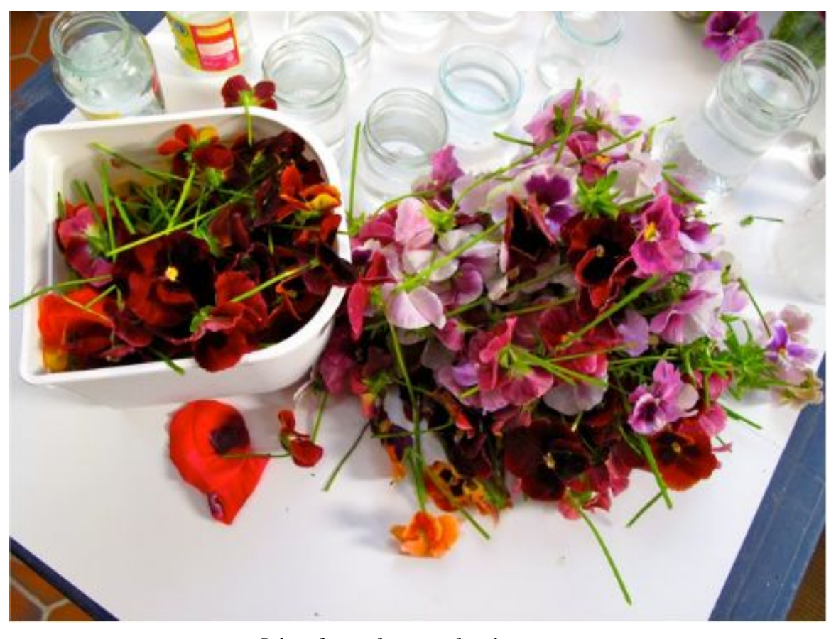
Palette for an afternoon of work.