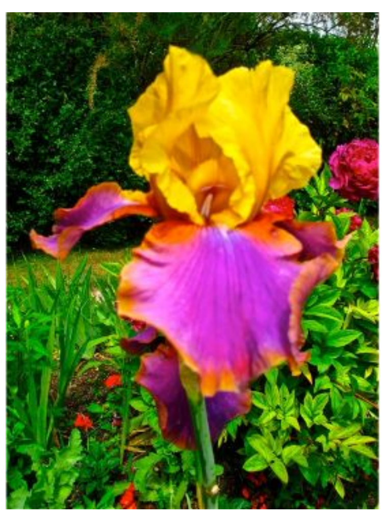
Crazy-color irises the size of a baby's head.