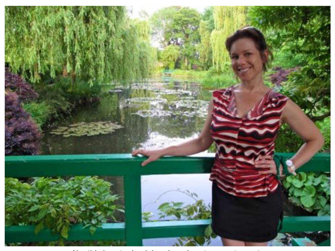
No, this is not a backdrop in a downtown restaurant.

CULTURE, TRAVEL, WOMEN'S FASHION | By E.V. DAY | JULY 16, 2010, 2:26 PM