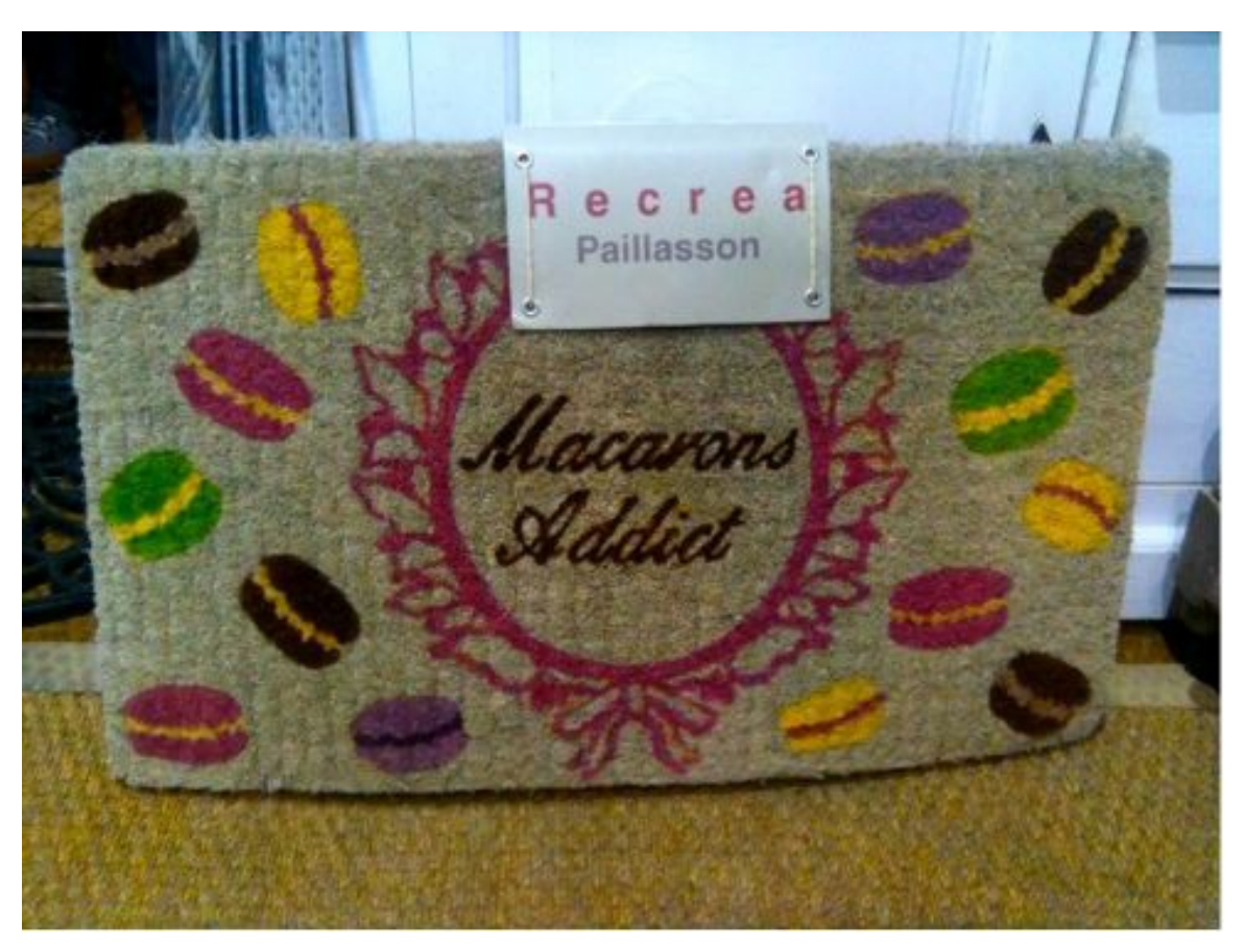
French pastry humor.