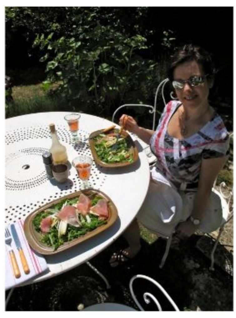
Lunchtime on the terrace.