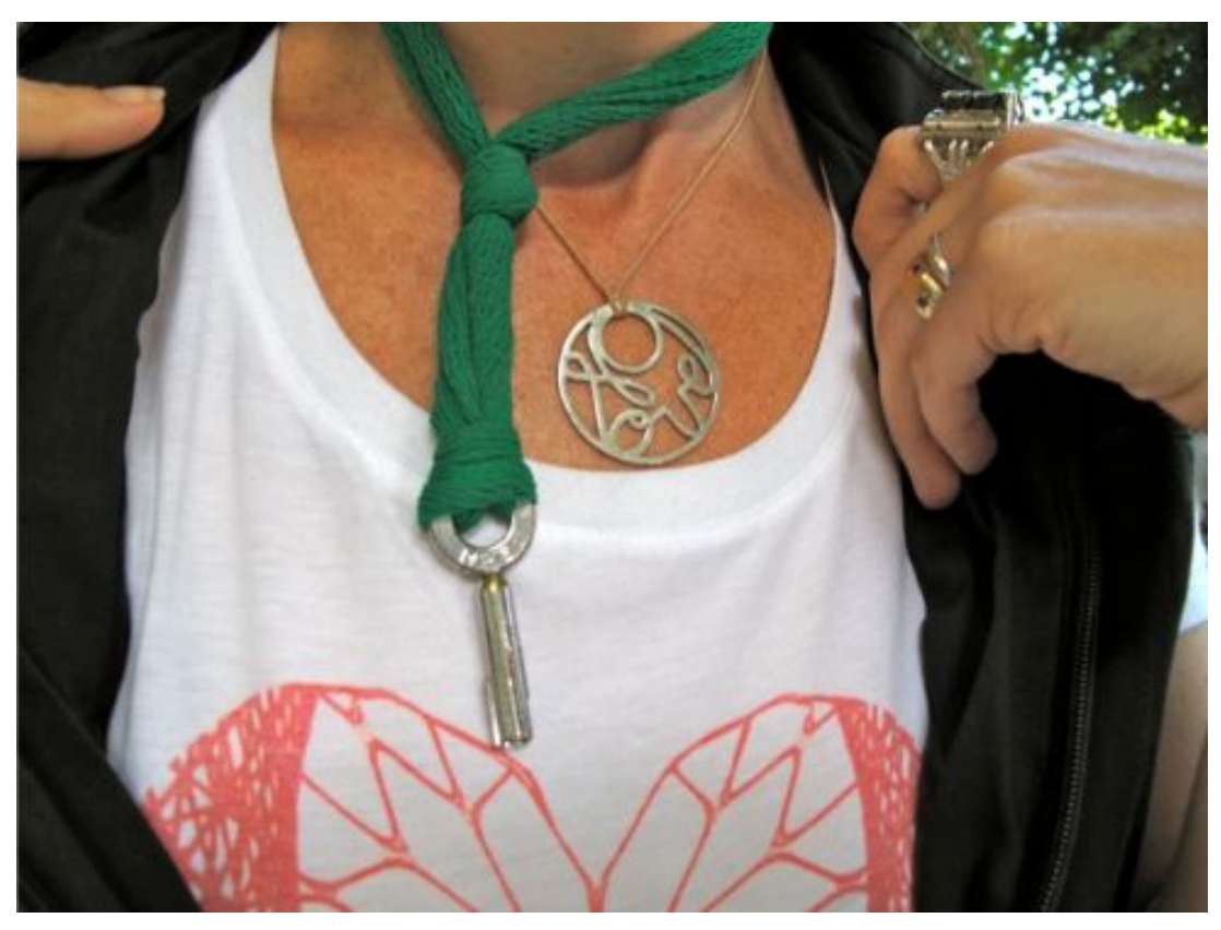
The key to the gardens on a Monet-green fishnet stocking.