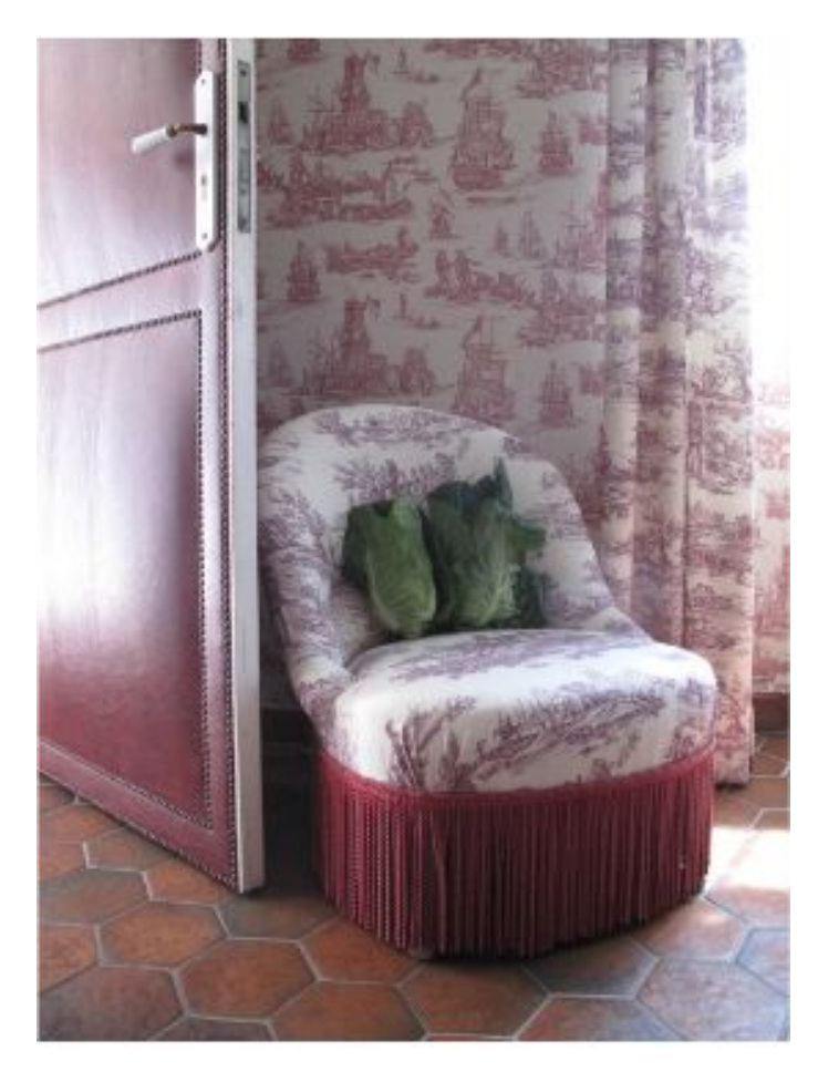
A view of my "toile-tastic" chambre.