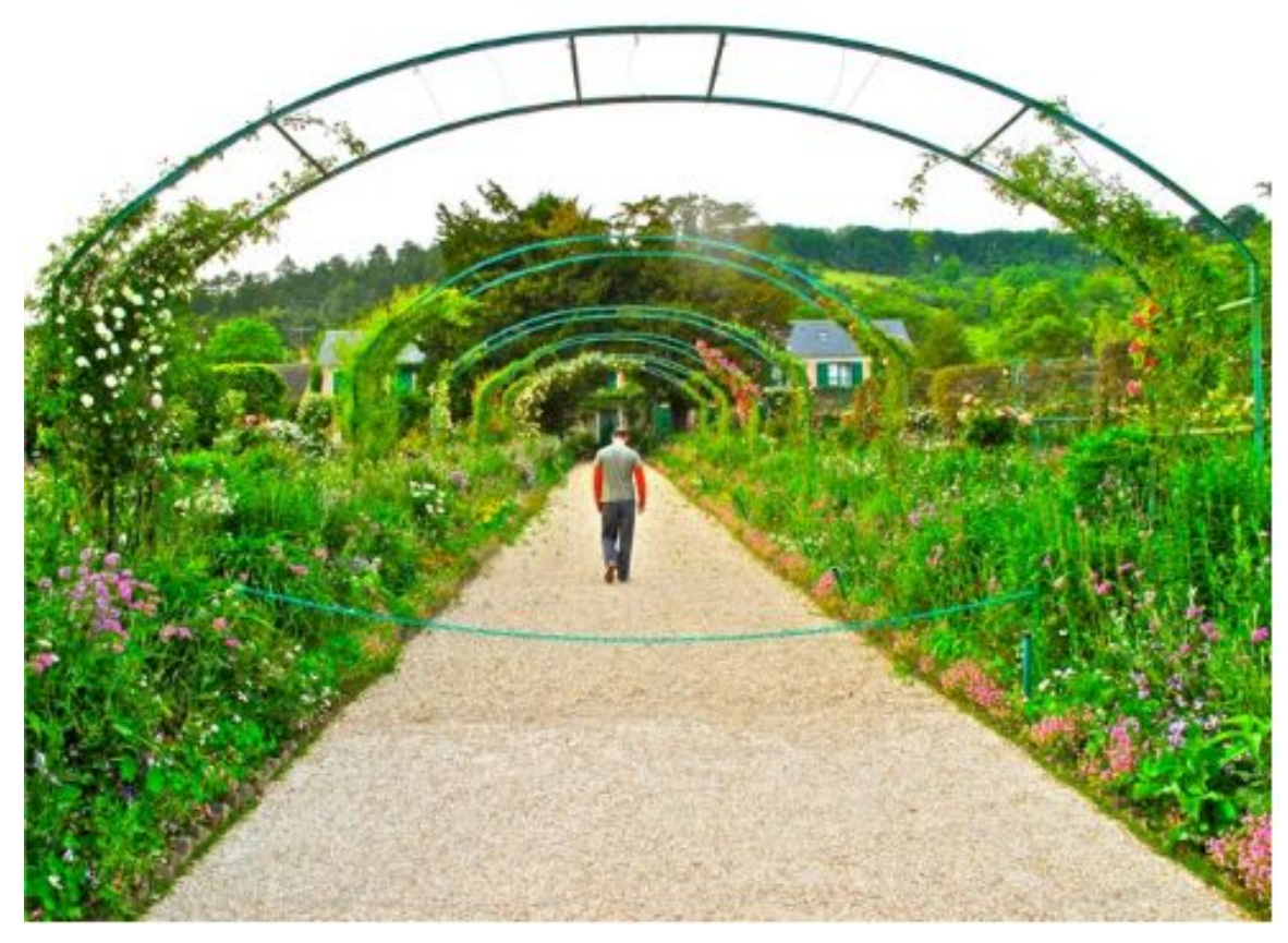
Every view of the garden reminds me of a Monet painting. Surreal!