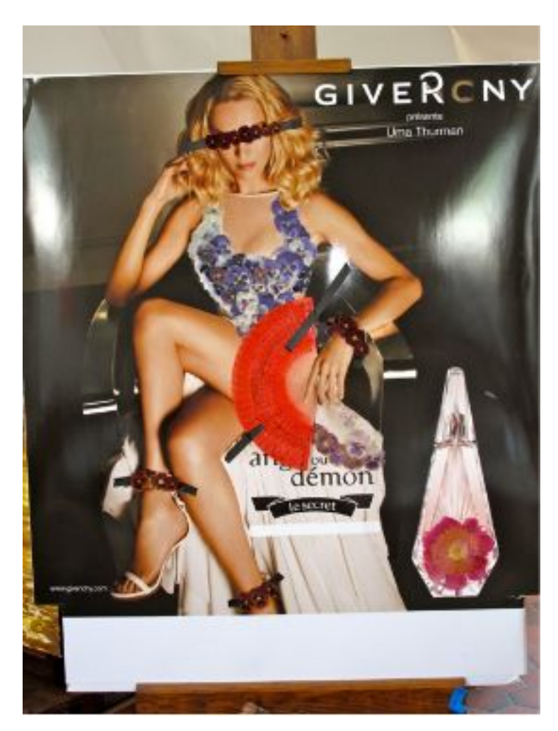
"Givenchy meets Giverny."