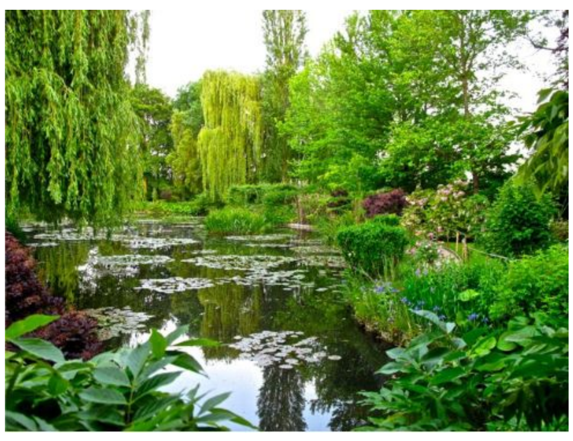
A set, ready for action. Hoping Kembra Pfahler from the Voluptuous Horror of Karen Black will make an appearance here very soon.