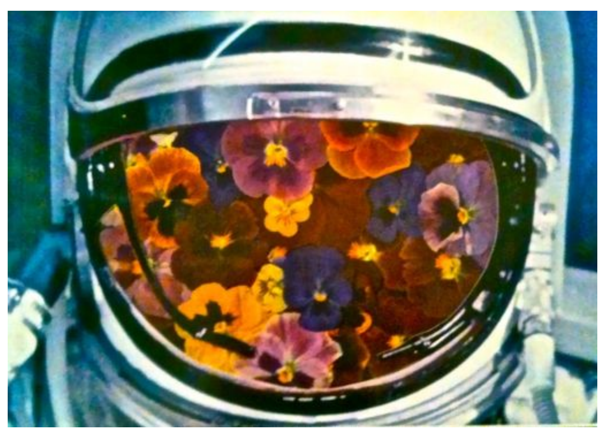
Being in Monet's garden is like visiting a planet saturated with color.