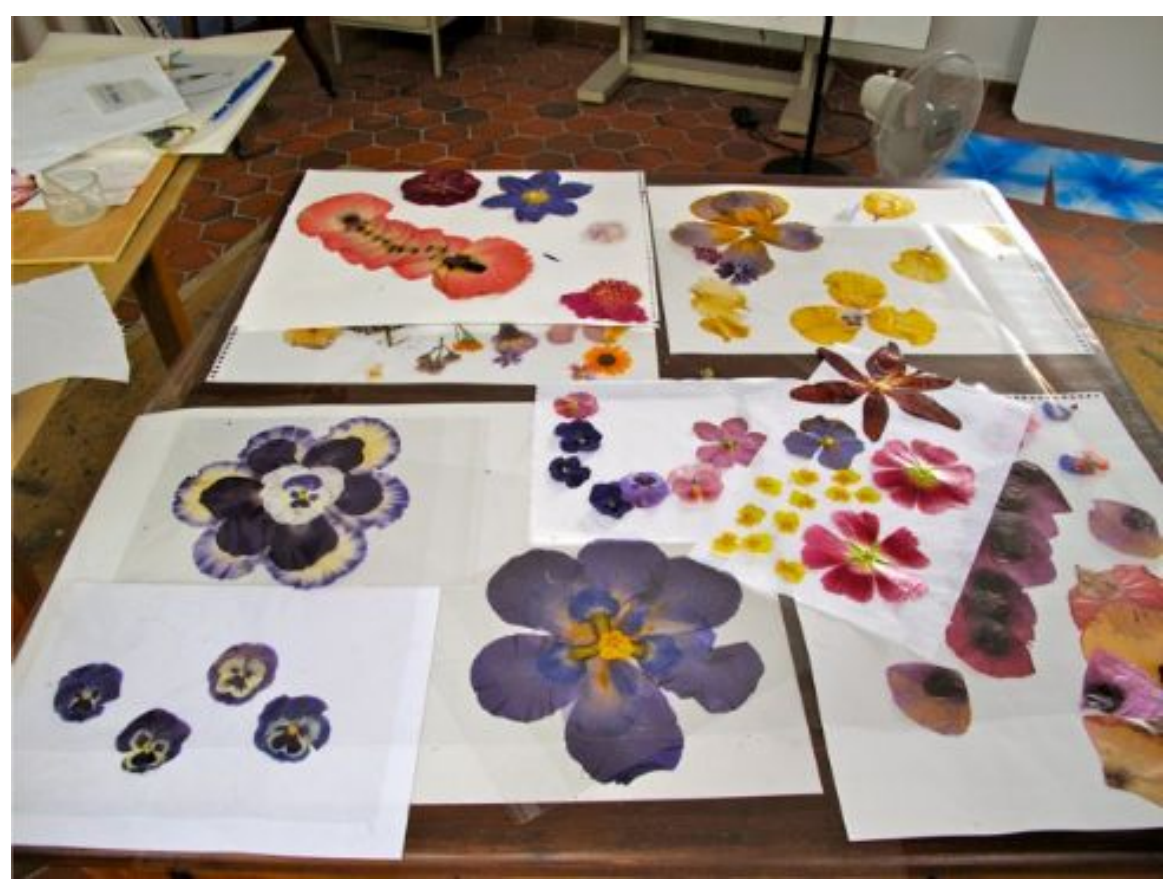
My flattened "fleurs fanées" for collages, etc.