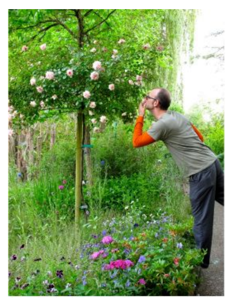
Always time to smell the roses.