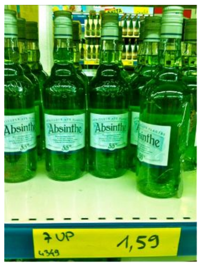
Absinthe is "Monet green."