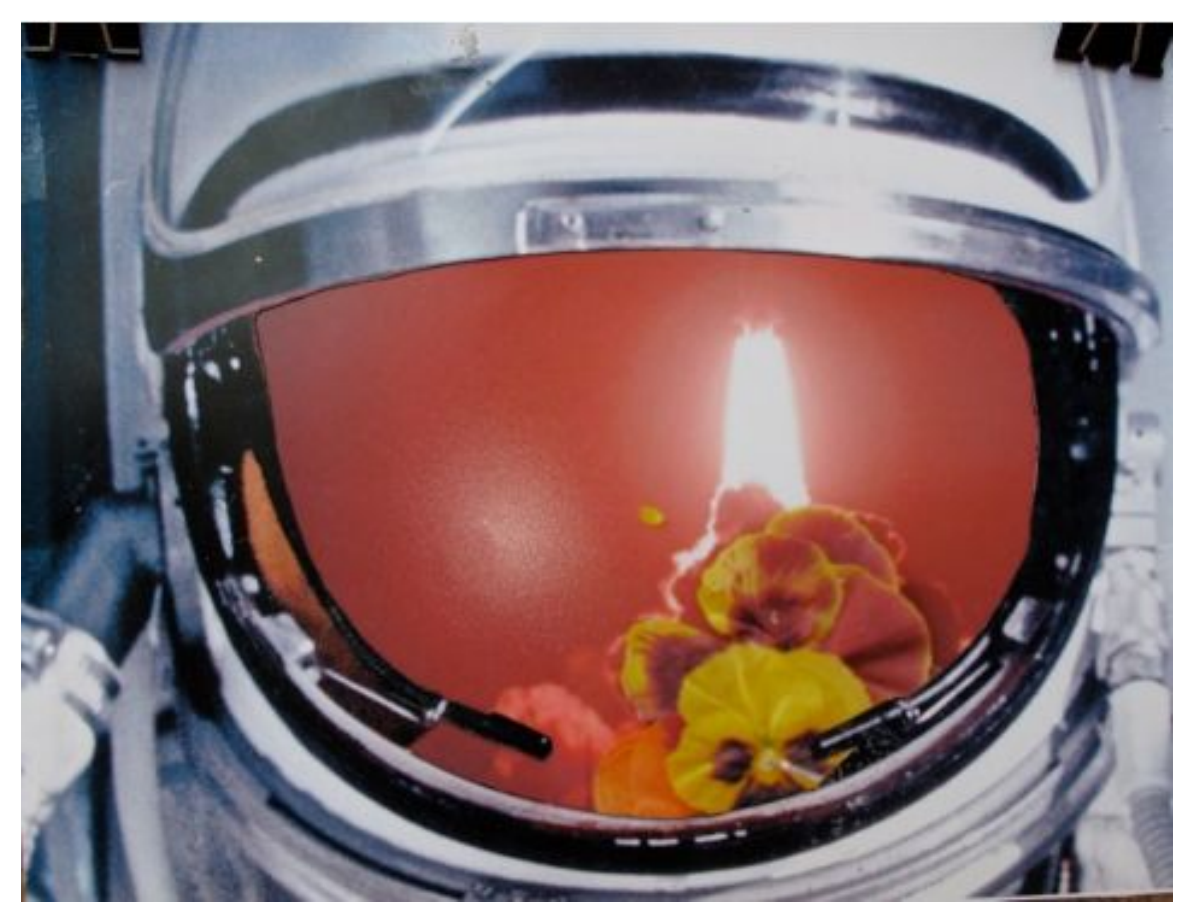
The vividness is inescapable!