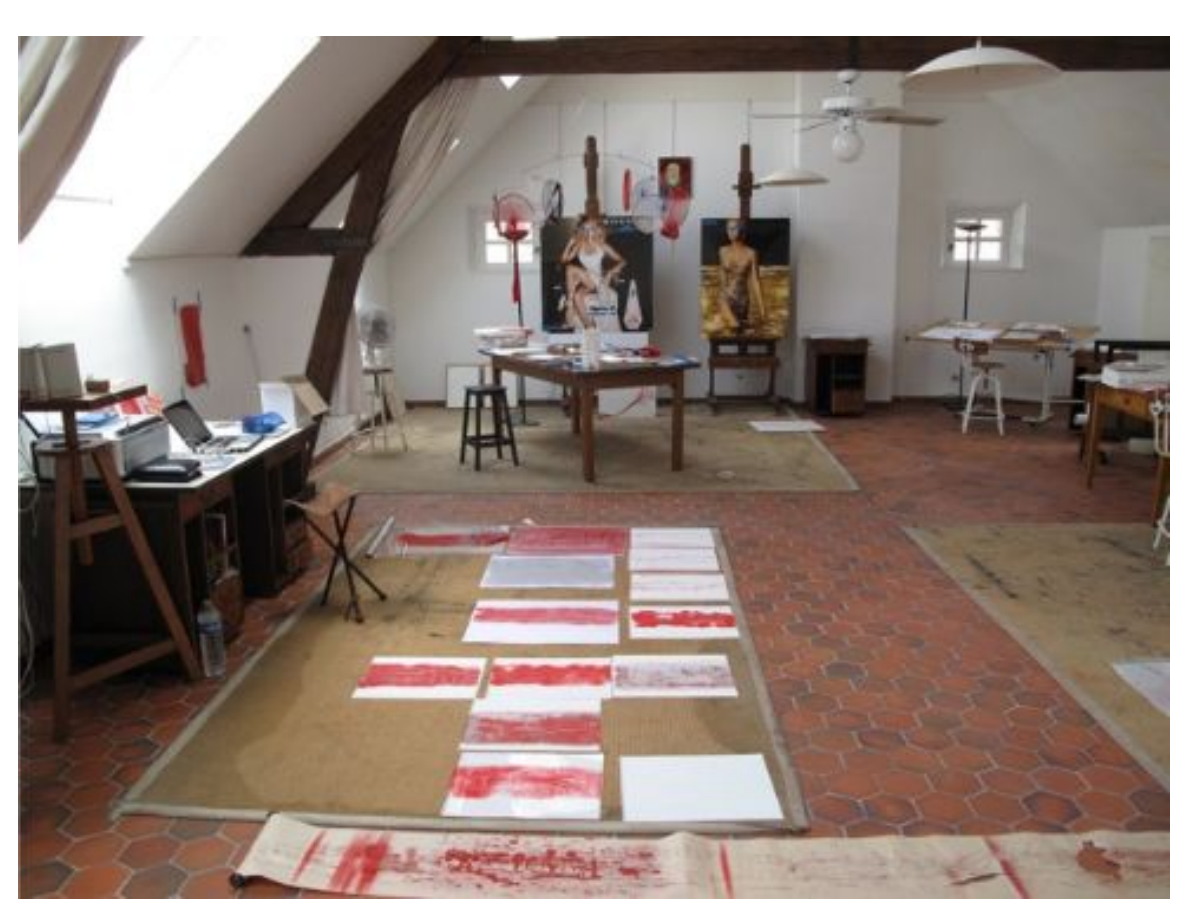
My humble French country studio!