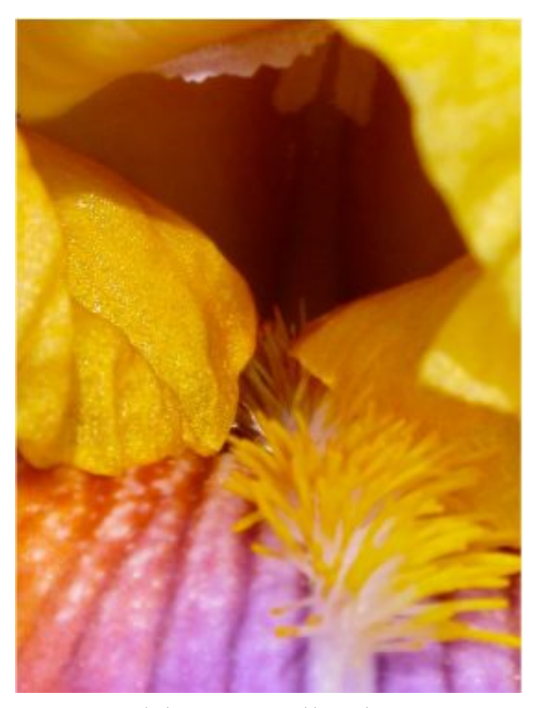
The better to eat you with, my dear...