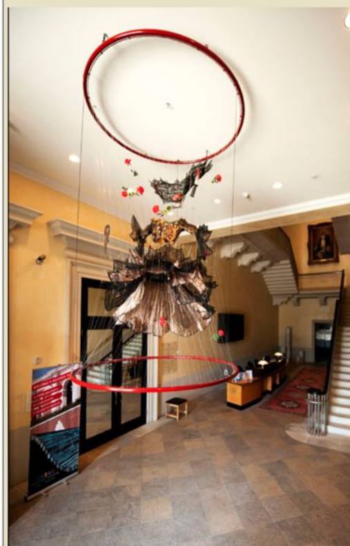
Carmen at the Meadows Museum