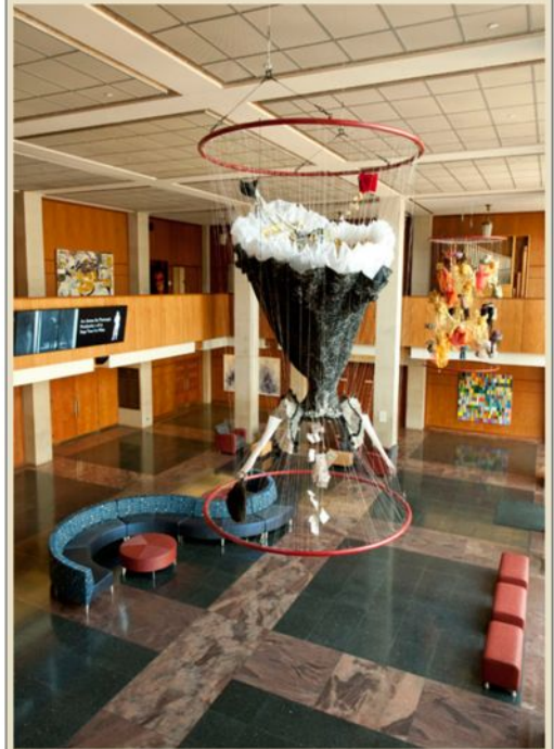
Merry Widow at SMU Owen Arts Center