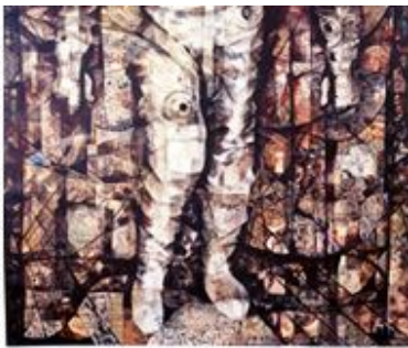
First Steps , 1963 Mitchell Jamieson Acrylic, gauze, and paper on canvas